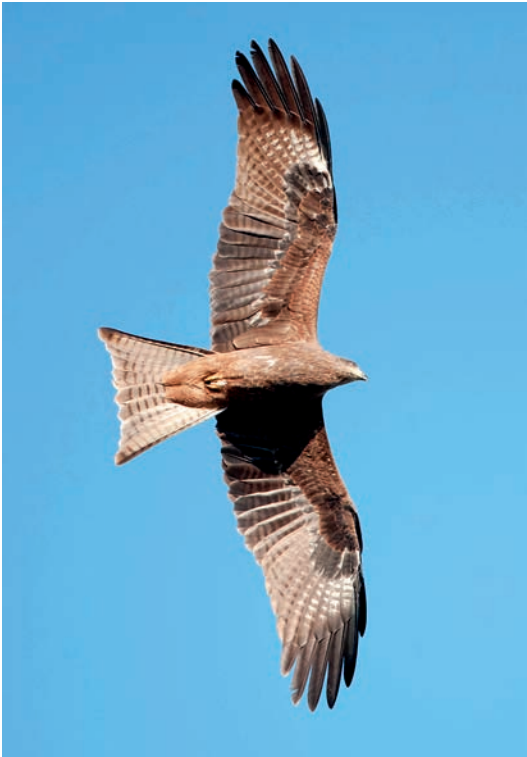
Plate 2. Adult Black Kite Milvus migrans , 19 November 2011.