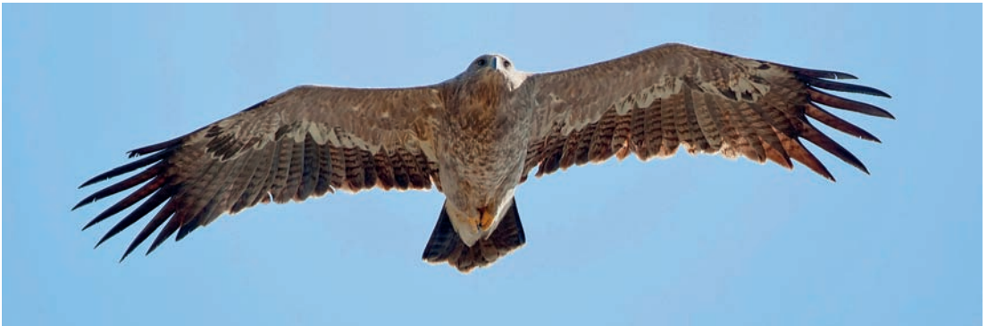
Plate 8. Third plumage Steppe Eagle, 21 November 2011.