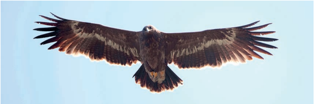
Plate 7. Second plumage Steppe Eagle, 19 November 2011.