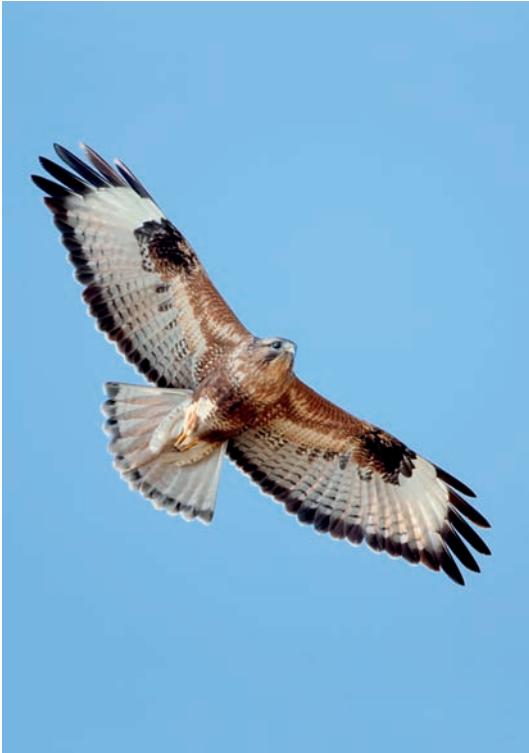
Plate 4. Common Buzzard Buteo buteo vulpinus , 22 November 2011.