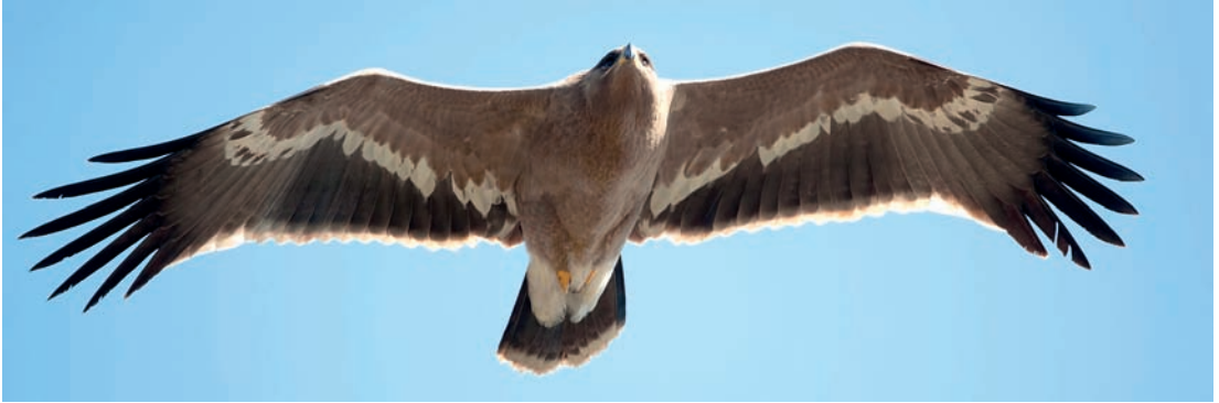
Plate 6. First plumage (juvenile) Steppe Eagle Aquila nipalensis nipalensis , 24 November 2011.