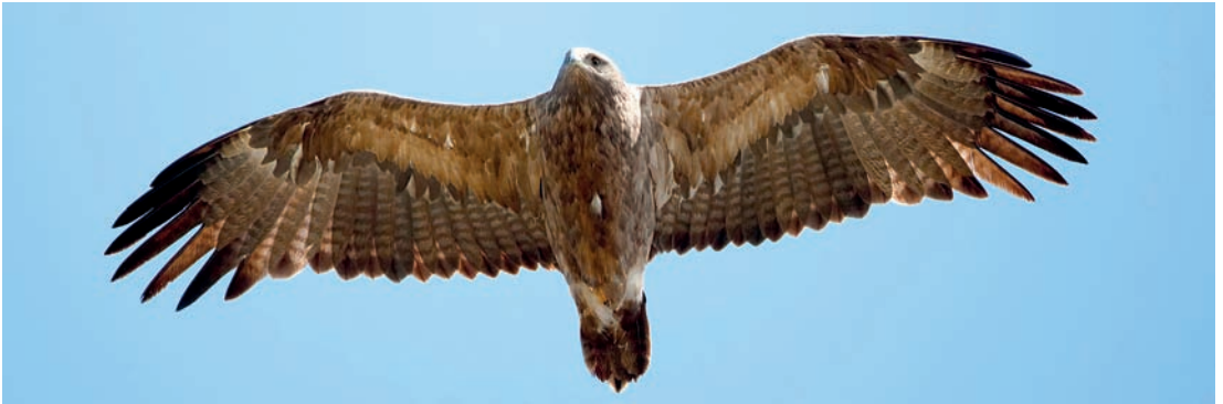
Plate 10. Adult Steppe Eagle, 23 November 2011.

and 1999 (1 November–28 February), but none has been seen since (Lim 2009).