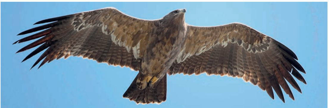
Plate 9. Fourth plumage Steppe Eagle, 21 November 2011.