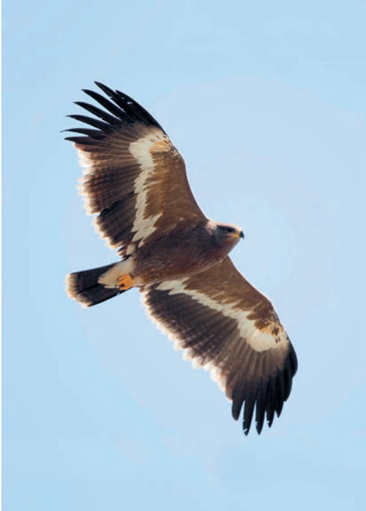
Plate 11. First plumage (juvenile) Steppe Eagle, 20 November 2011.