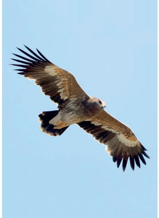
Plate 12. Second plumage Steppe Eagle, 22 November 2011.