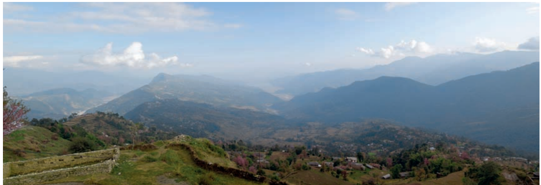
Plate 1. View from the raptor watch site at Khare, Paudur Hill, Nepal, 25 November 2011.

All images were taken at the raptor watch site at Khare, Paudur Hill, Nepal.