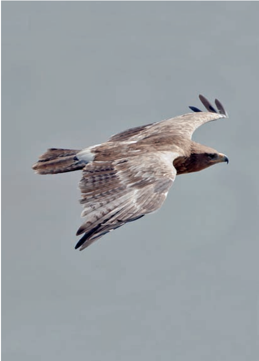
Plate 13. Third or fourth plumage Steppe Eagle, 23 November 2011.