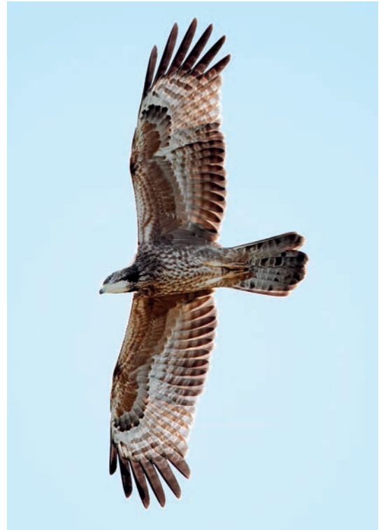
Plate 3. Juvenile (first year) Oriental Honey Buzzard Pernis ptilorhynchus , 22 November 2011.

Figure 1. ▲ Khare (Nepal) – location of current migration study at 1,646 m; the town of Dhampus is directly north across a valley at approx. 1,800 m. (1) Ghasa in the Kaligandaki valley, (2) Kathmandu Valley, (3) Ilam District, (4) Bardia National Park, (5) Jhatingri and Dharamsala, Himachal Pradesh, India, (6) Chihkiang [Hongjiang], China, (7) Eastern Tibet, (8) Kalamaili, Xinjiang Province, China.