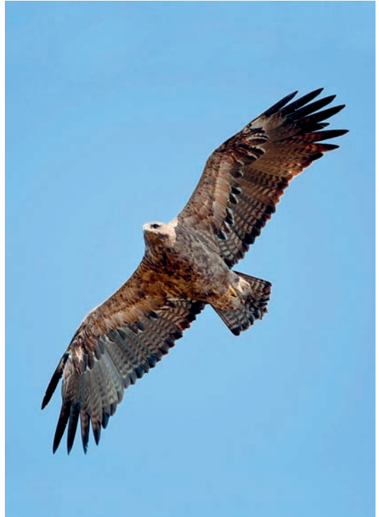
Plate 14. Adult Steppe Eagle, 24 November 2011.